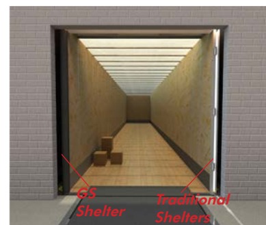
Rubber trim seals hinges on swing door trailers to block air and light gaps

MADE TO WITHSTAND IMPACTS: The GS shelter has foam side pads that easily bend and compress out of the way of off-center trailers to prevent unit and building damage, and side curtains attach with Velcro® to eliminate dock downtime.