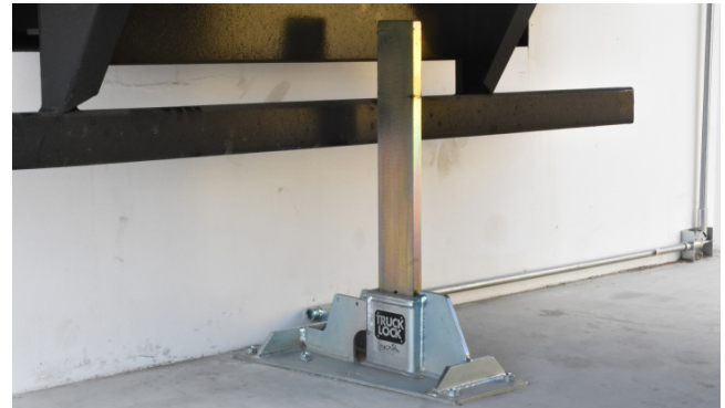
Truck Lock™ 350 Series – Flange Style

FEWEST MOVING PARTS: Truck Locks™ are extremely low maintenance, requiring preventive service once or twice per year.