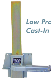
Low Profile Cast-In Style

LONGEST WARRANTY: Truck Locks™ include a lifetime warranty – the longest in the industry!