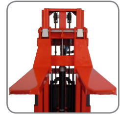
Adjustable forks are available in many different lengths and types.