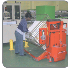
Available with Rotator and/or optional extras, e.g. drum turner, remote control and level control.

Strong construction ensures a long operating life and low maintenance costs.