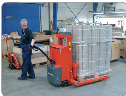
Optimum safety through transparent and impact-resistant safety screen and reduced driving speed in raised position.