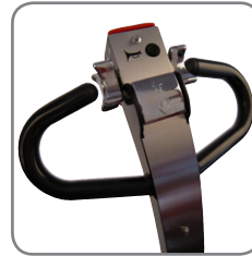
Possible to operate with the handle upright. Central location of all control buttons.