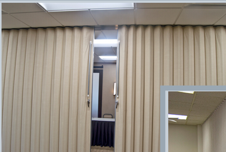
Accordion Style Wall Partitions

In a lot of school environments, getting space that works for everyone can be challenging! A lot of schools use our wall partitions to divide up big rooms into smaller rooms for different purposes. Our partition walls are easy to operate and we have several different options available (including operable walls and accordion partitions) to suit your needs. Give us a call or send us an email at sales@barroneq.com for more information.