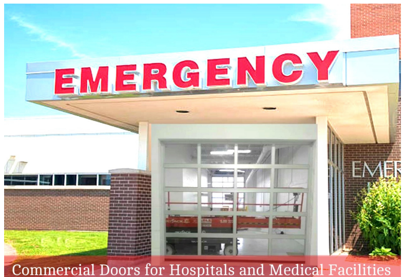
Commercial Doors for Hospitals and Medical Facilities