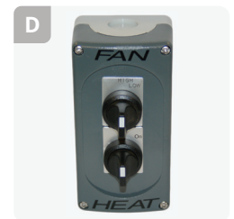
5"H x 2.5"D x 2.78"W