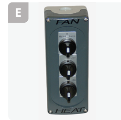
6"H x 2.5"D x 2.78"W