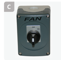
3.5"H x 2.5"D x 2.78"W