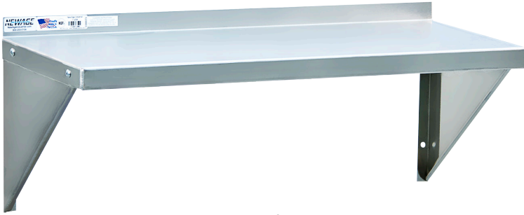
Solid Wall Shelf • H.D. & Standard

These shelves are ideal for maximizing storage and organization above sinks, stoves, tables, etc... Smooth, marine edge surface helps contain spills and aids in quick clean-up.