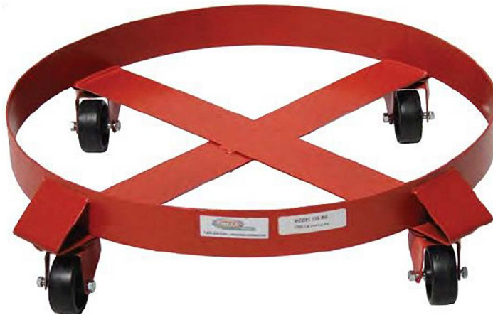
536-RG OUTRIGGER DRUM DOLLY