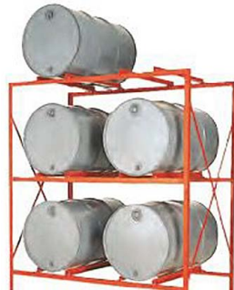
DR6-3H 6 DRUM RACK