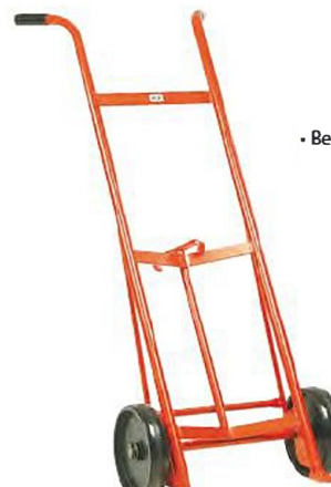
62P ECONOMY • Best buy for the money