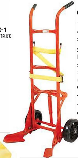
29VR-2 POLY DRUM TRUCK for overpacks