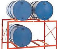
DR4 4 DRUM RACK