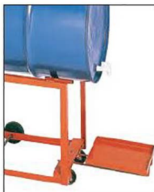
ncnb OPTIONAL DRIP PAN