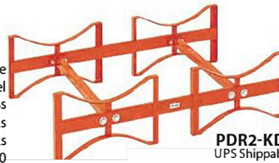
PDR2-KD UPS Shippable

All welded PDR2 is identical except for bolts