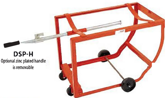
DSP-H Optional zinc plated handle is removable

ALL MODELS SHIP SET UP VIA UPS - HANDLE SHIPS IN SEPARATE BOX