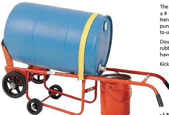
45VR-KS-1 POLY DRUM DRAINER TRUCK

Kickstand is included for upright storage. Not for use with overpacks.