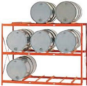
DR9 9 DRUM RACK