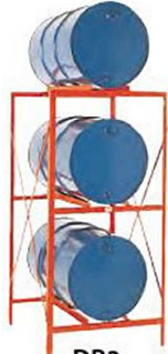
DR3 3 DRUM RACK