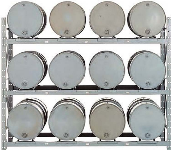
DPR12 12 DRUM PALLET RACK

• SHIPS KNOCKED DOWN • ALL UNITS 36" DEEP