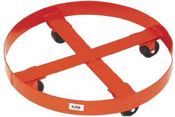
436R ROUND DRUM DOLLY