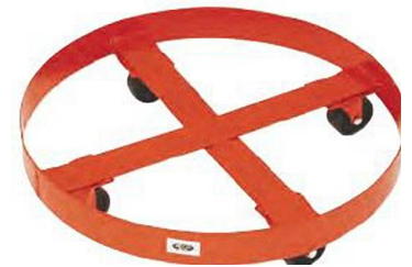
437P OVERPACK DRUM DOLLY