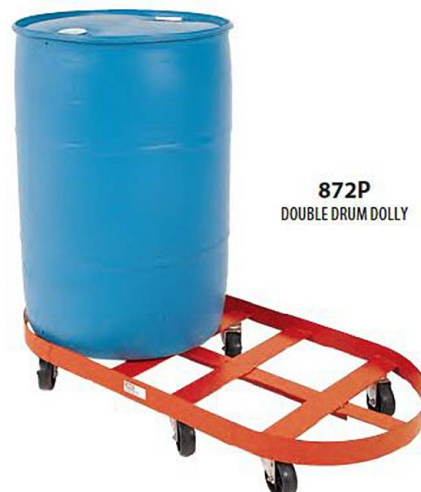
872P DOUBLE DRUM DOLLY