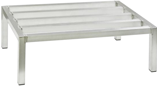
6000 Series - Dunnage Racks