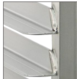
6000 Series Angle Guides and Welds